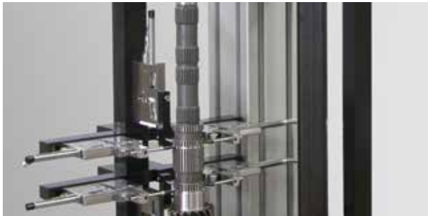
Example for the integration of several measuring blocks XP206 and XP211 into a measuring system