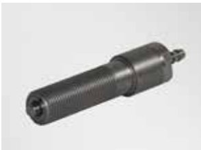
Micro cylinder for pneumatic stroke or thrust Art. no. X426000-010