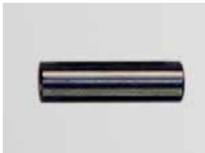
Probe holder with female thread M2.5 Art. no. X426000-002 (L=20 mm) Art. no. X426000-003 (L=30 mm) Art. no. X426000-004 (L=40 mm)