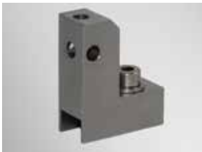
Support bracket Art. no. X426000-001