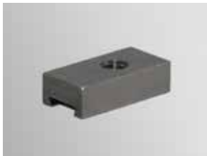
Mounting flange (part of X426000-001) Art. no. X426000-011