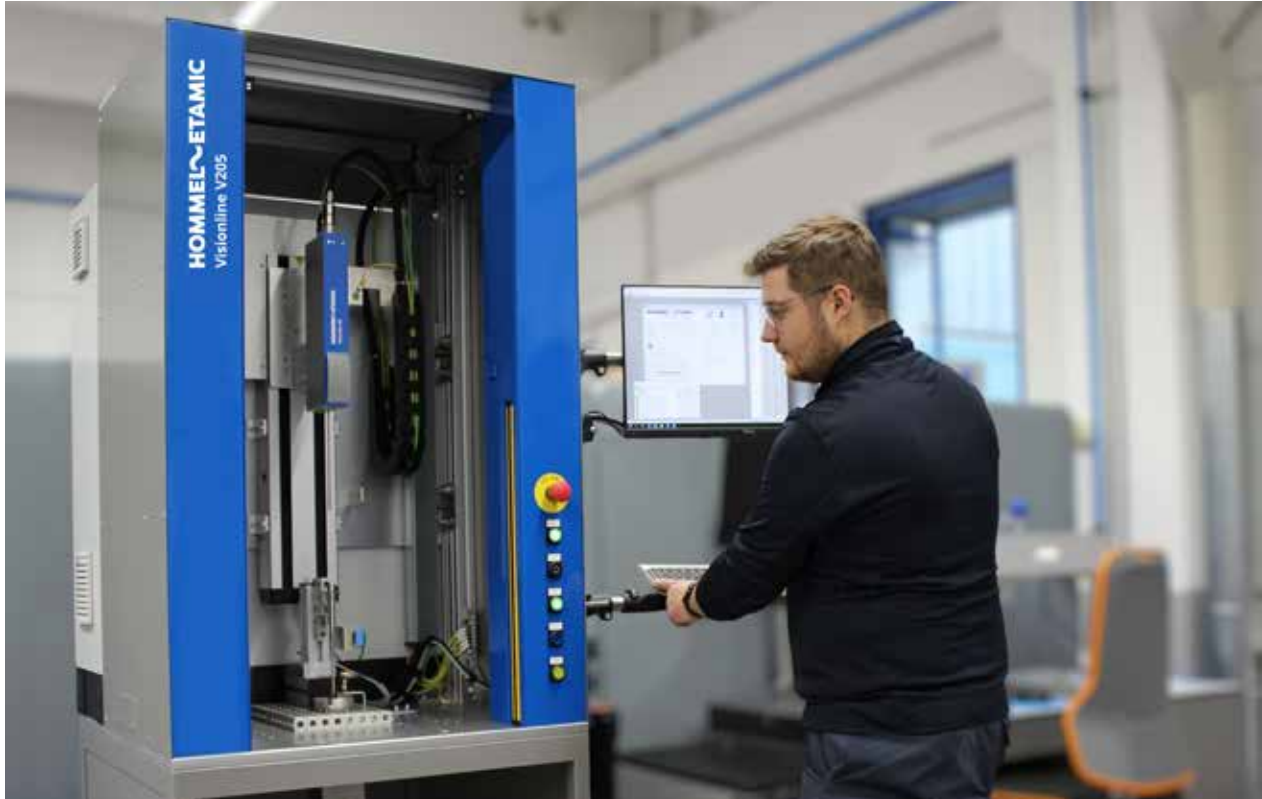
Configuration example optical inspection system Visionline V205