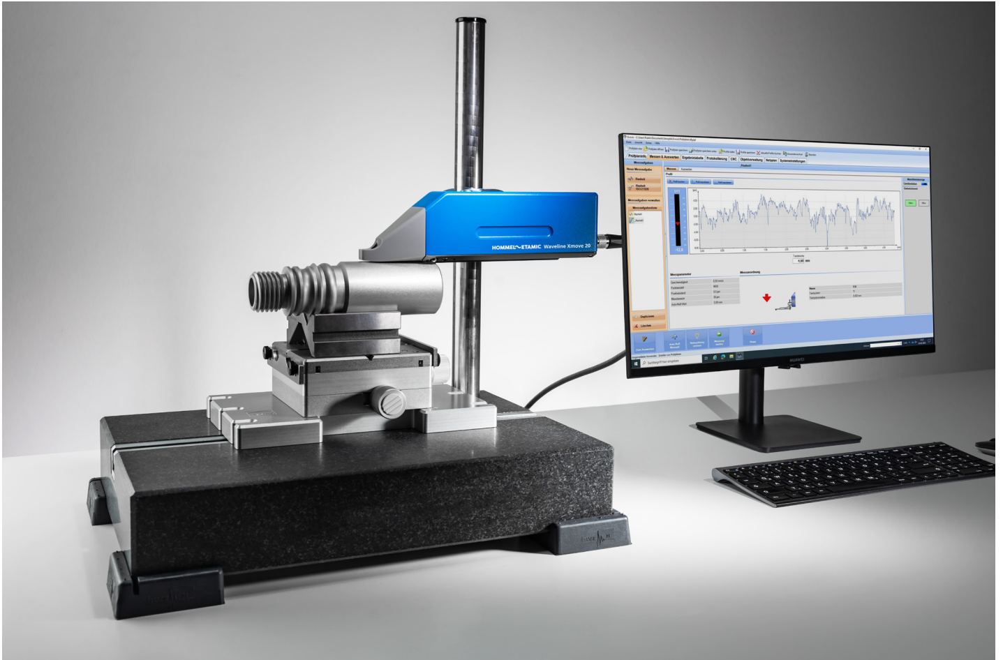
Waveline W40 with optional MS300 measuring station, PC and accessories